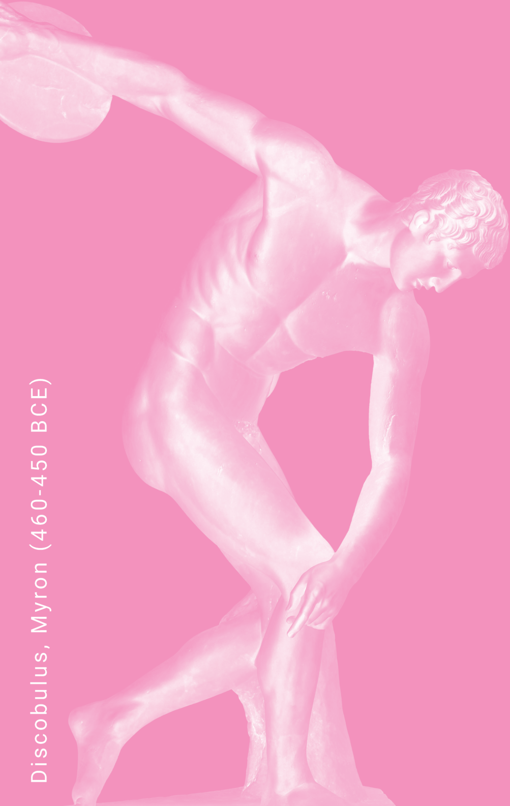
Discobolus, Myron (460-450 BCE)