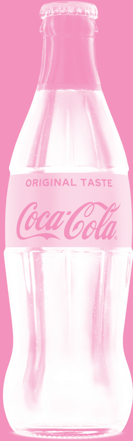
Coca-Cola, The Coca-Cola Company (1912)