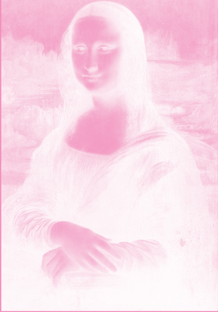
Mona Lisa, Leonardo Da Vinci (1503)