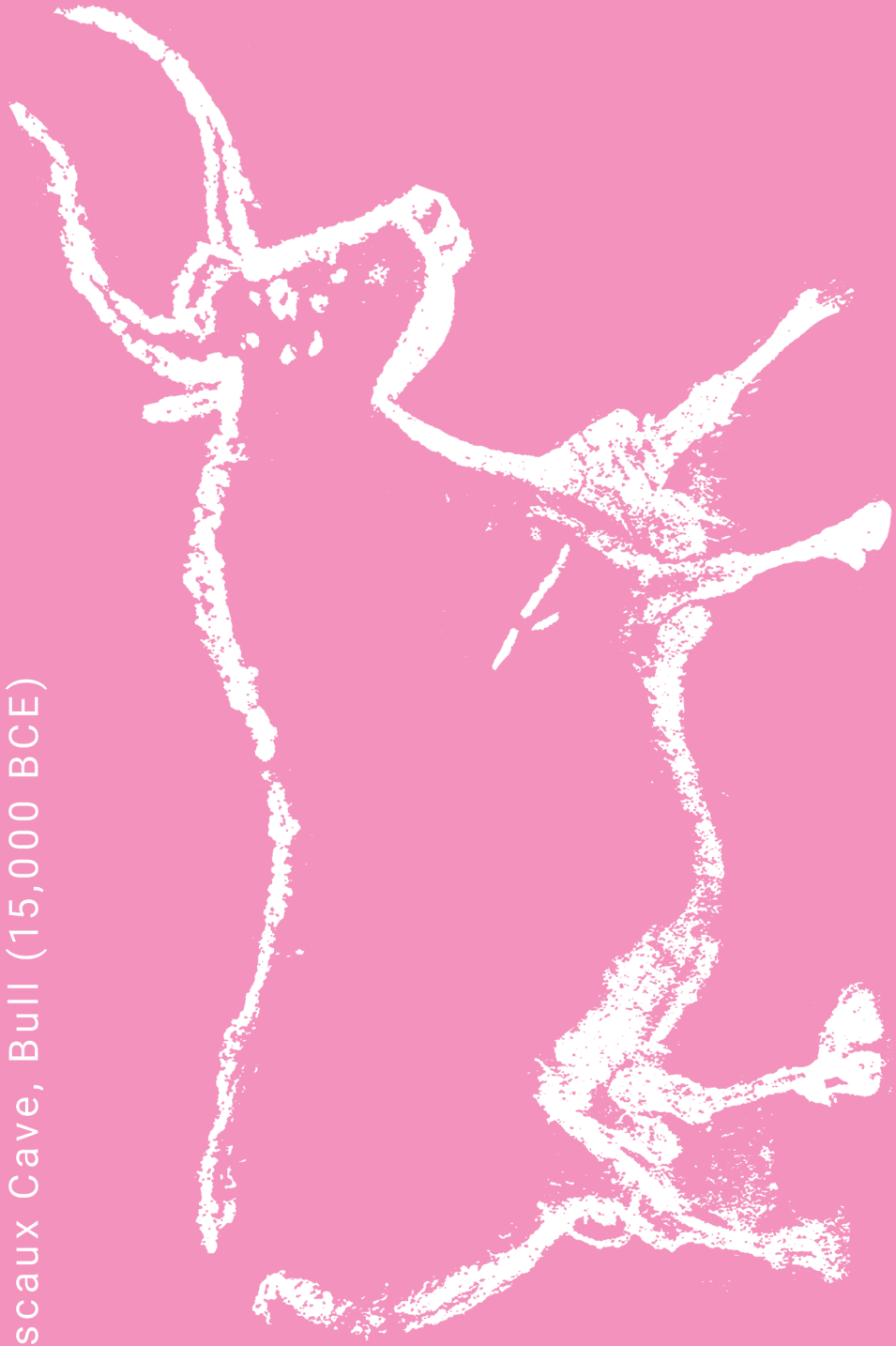
Lascaux Cave, Bull (15,000 BCE)